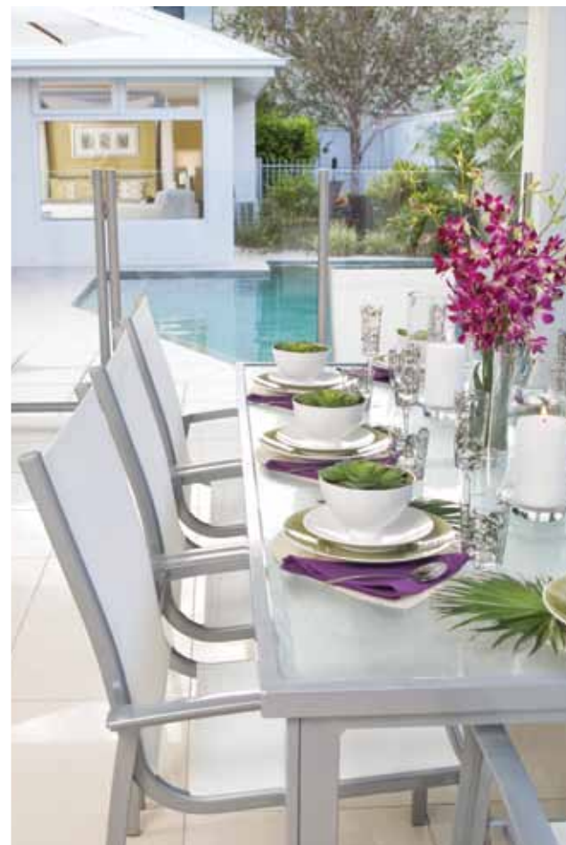
Open plan design allows for easy entertaining whether you choose to be indoors or out.

Just a short trip across the Maroochy River is Cotton Tree , it's water front restaurants offer the perfect place to unwind. Take in views of Maroochydoore while you enjoy a romantic sunset dinner for two.