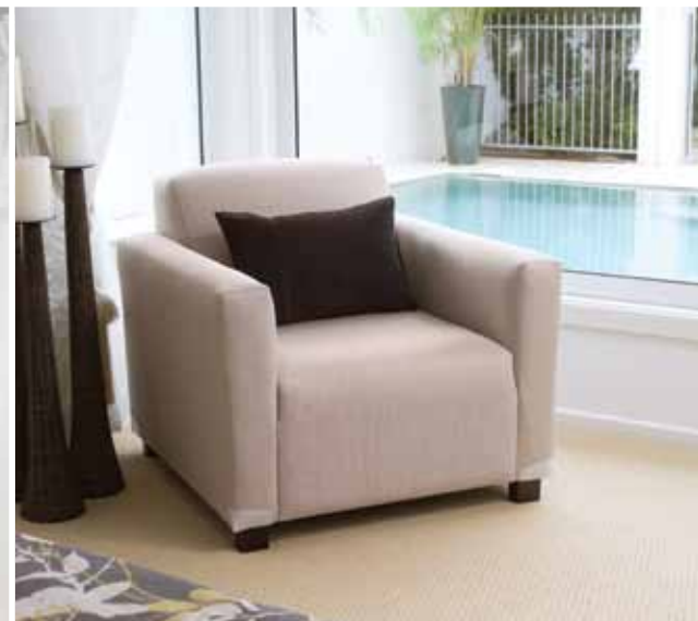
The master suite features a large ensuite.