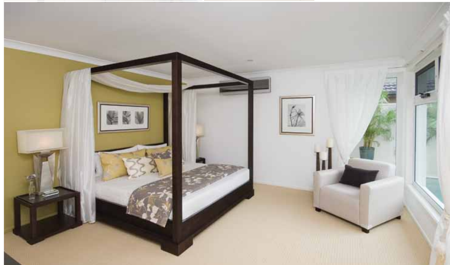
A generous feature window floods the spacious master suite with sunlight and offers views to the pool.